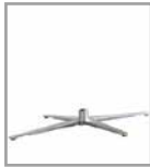
4-spoke leg, surcharge satin nickel