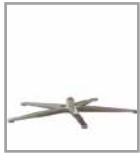
5-spoke base diff. metal col.