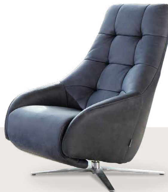
Cover: Z78/28 navy

Striking topstitching in the back is the trademark of [filippoo]. The seat and back of the swivel-leg executive chair can be adjusted by motor at the touch of a button . Battery operation is also available at extra cost. The headrest is infinitely adjustable and the 4- and 5-star legs are available in various metallic shades. A contrasting colour thread can be ordered in the leather version.